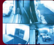
VIDEO MONITORING & VIDEO ANALYTICS