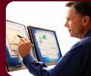
ELECTRONIC ASSET MANAGEMENT SYSTEM