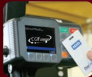
VEHICLE PERMISSION SWITCH & TRACKING