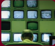
IP VIDEO SURVEILLANCE